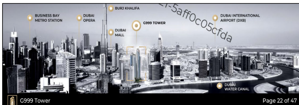
Image allegedly promoting G999 Tower and the tokenized real estate offering

In October 2023, GS Partners allegedly announced losses tied to trading, and these losses negatively impacted many purchasers of certificates. According to the order, these losses led to the implementation of a “Market Protection System” or “MPS.” The MPS allegedly limited many investors’ ability to withdraw certain types of profits by taking up to 50% of the withdrawal and transferring it to an undisclosed “13 month lock up vehicle.” It also allegedly increased fees paid with receiving assets.